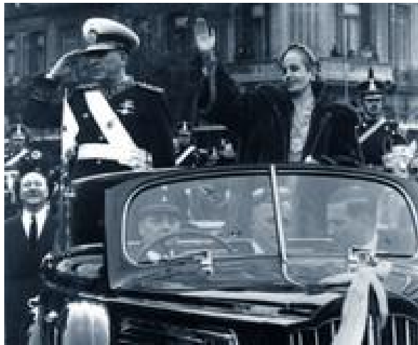
Perón and the ailing Evita during his second inaugural parade, June 1952. Eva died the following month.

Although the causes of the Dirty War are complicated, it was heavily influenced by inequality and foreign support for revolutionary movements. The Argentine situation was largely the result of social and political tensions left unresolved from the Perónist era (1946-76). Juan Domingo Perón, a charismatic, pioneering populist leader who was fervently supported by some and deeply hated by others, was President of Argentina initially from 1946 until 1952.