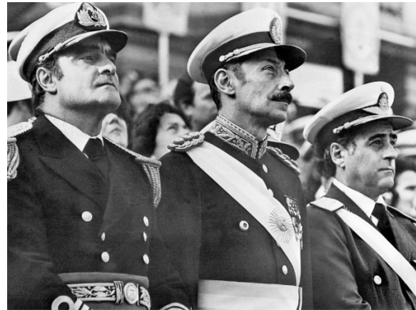
The junta in 1977: Admiral Emilio Massera, President Jorge Videla and General Orlando Agosti

Civilian rule was replaced by the military junta , formally known as the Proceso de Reorganización Nacional, often simply known as el Proceso, "the Process," initially under the presidency of Lt. Gen. Jorge Rafael Videla. 24 After the successful coup and the eradication of democracy, a military dictatorship ruled the country and all its affairs.