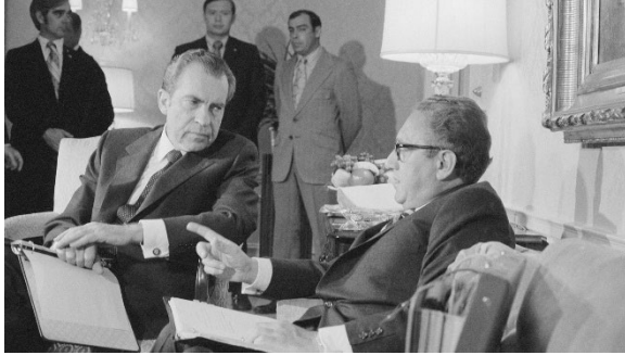
U.S. President Richard Nixon talks with his National Security Advisor, Henry Kissinger in 1972

opposition, depending largely on the preferences of each US President. For Republican Presidents, anti-communism was most important. Democrats tended to stress human rights and restoration of democracy more.