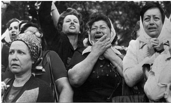
Relatives of the missing persons in Argentina demonstrating in 1977 in Buenos Aires.

Can the OAS refuse to get drawn into a divisive conflict, polarizing its 35 Member States, or is it compelled to act on the newly emerging principles of international responsibility for human rights? Does it have the ability to help resolve the conflict and strengthen return to democratic rule?