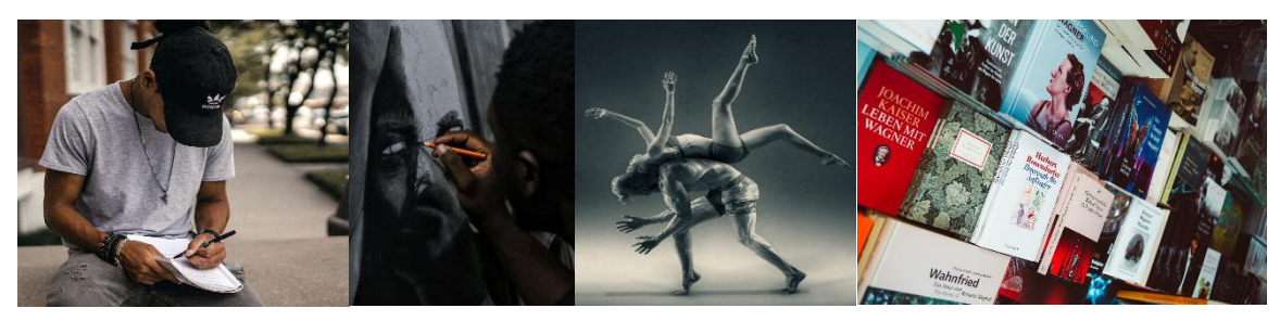
Design Your Future in the Humanities at ODU

We also serve as a key community outreach and engagement arm for the University, sponsoring and hosting an array of speakers, performers, and public forums as part of our Humanities in Hampton Roads initiative.