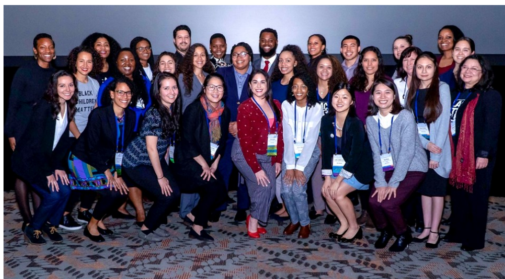
Pictured above: Mentors and mentees of the Frances Degen Horowitz Millennium Scholars Program at the 2019 SRCD conference in Baltimore, MD