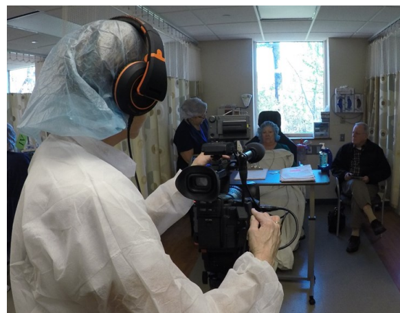
The Ophthalmic Medical Technology Program, from the School of Medical Diagnostic & Translational Sciences, recently took part in a video project.