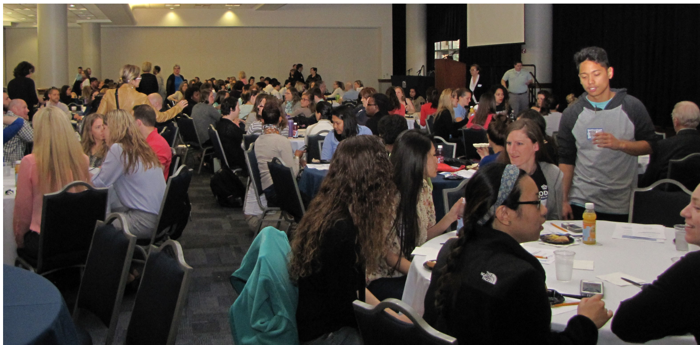
Faculty, staff, students and guests gather in the Big Blue Room at the Ted Constant Convocation Center on April 3 for IPE Day.