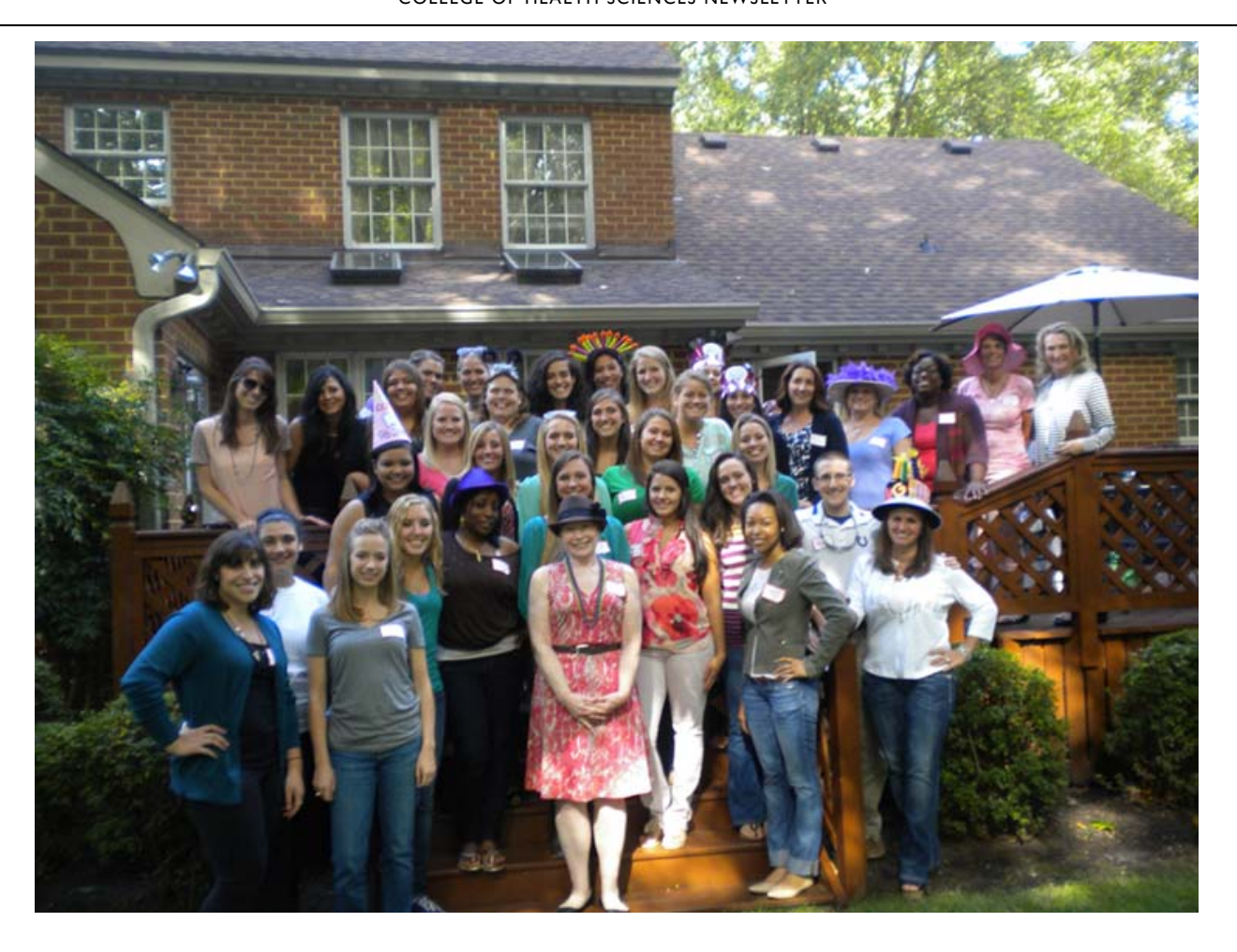
Celebrating 100 Years of the Dental Hygiene Profession