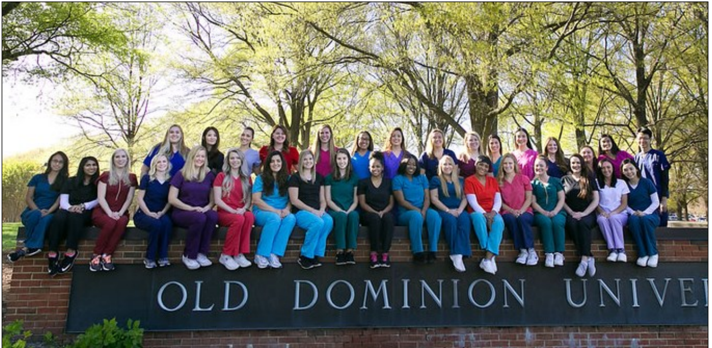
The 2018 Dental Hygiene class.