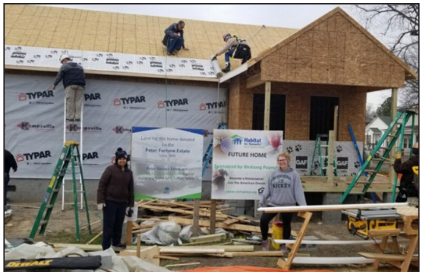
Top and above, the PHSA works with Habitat for Humanity