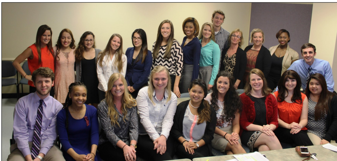
Senior nuclear medicine technology students presented papers last month on various topics as part of the 28 th Annual Nuclear Medicine Technology Colloquium of topics.