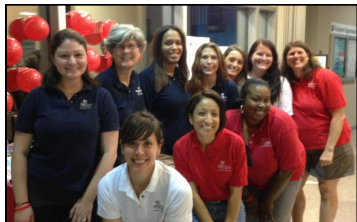
On April 13, 2013, nursing students registered 101 potential donors at a health fair and Relay for Life event.