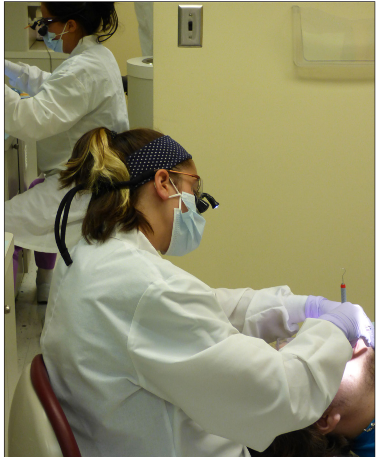
The School of Dental Hygiene's Dental Hygiene Care Facility will be closed during the spring semester.

I will continue to bring you exciting news from the college during this crisis, detailing stories of perseverance on behalf of our students, faculty and