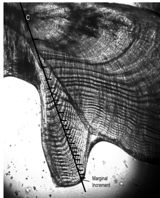
Figure 1. Thin-sectioned otolith from a 22-yr old sheepshead showing the core (C) of the otolith, the measuring axis with annuli marked, and the marginal increment or growth on the edge of the otolith.

All thin-sections were aged by two different readers using a Nikon SMZ1000 stereo microscope under transmitted light and dark-field polarization at between 8 and 20 times magnification (Figure 1).