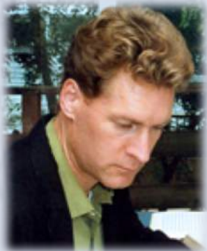
An Introduction to the “Kirchen Postilla”

Perry Library Learning Commons Conference Room, 1310/1311