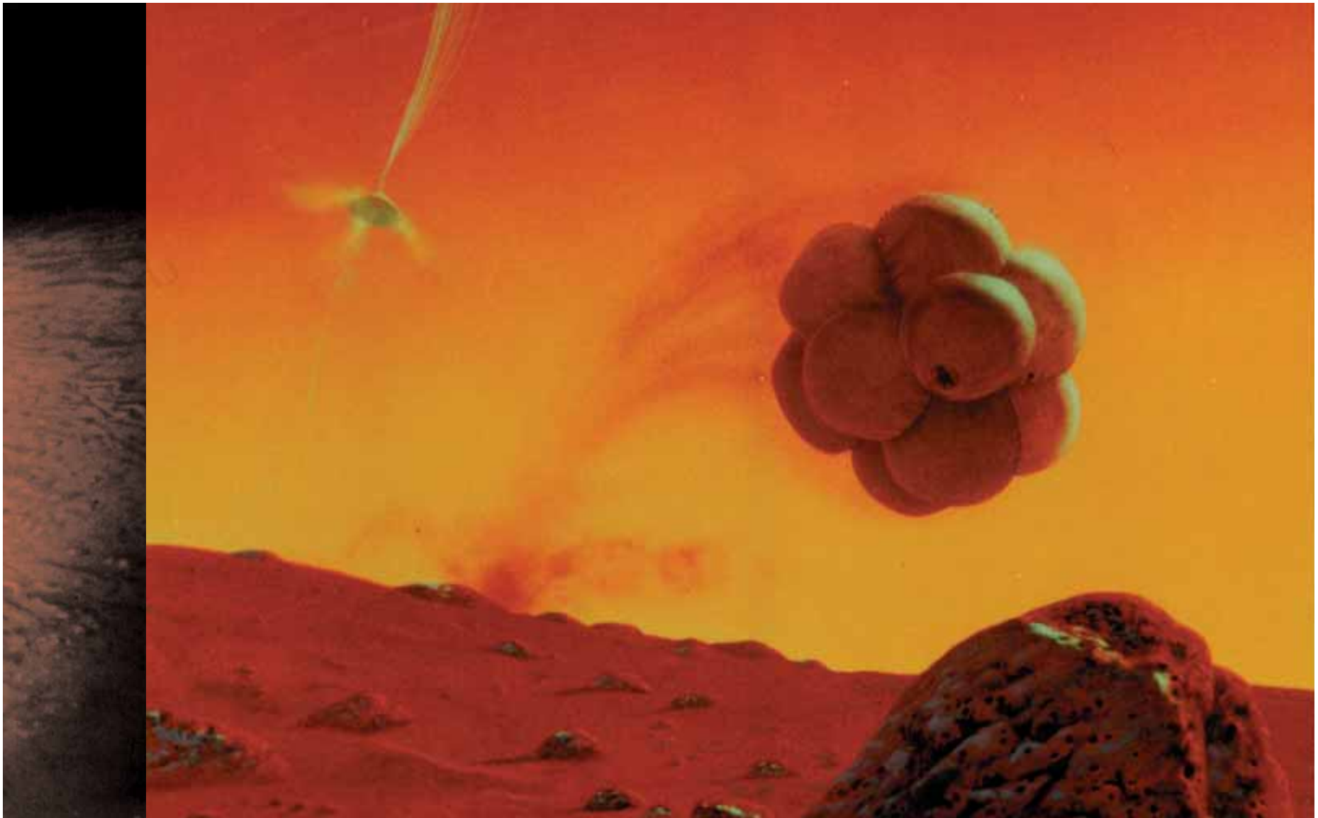
After disconnecting from its parachute, the Pathfinder pod bounces to a resting place, making it the first spacecraft on the surface of Mars in more than 20 years.