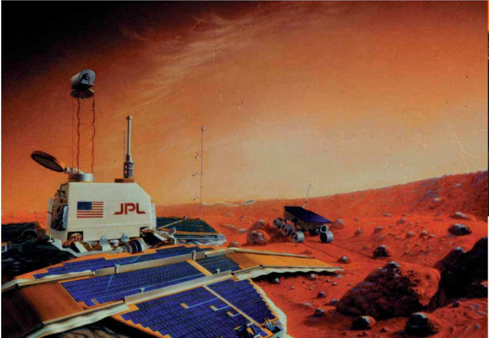
On Earth, television stations and Internet sites carried pictures generated by Rover Sojourner, the small wagon-like robot used to maneuver around the surface. Weighing less than 25 pounds on earth (nine pounds on Mars,) it was designed to travel no more than three meters a day, not venturing more than 10 meters from the lander (at left).