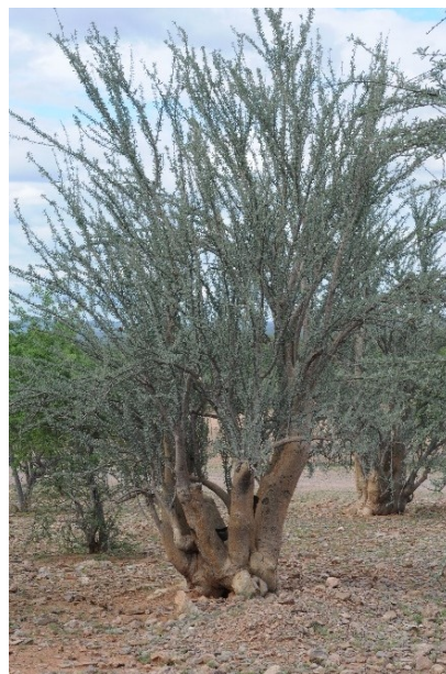
The shrub Sesamothamnus guerichii

While conducting field work on Hydnora in northwestern Namibia we happened upon a population of a distinctive shrub, Sesamothamnus guerichii with the descriptive common name of Herero sesame bush. It grows almost exclusively in the region of the Herero peoples in Namibia and is in the same family, Pedaliaceae, as the familiar sesame plant, Sesamum indica the source of sesame seeds. What caught our eye was nothing familiar, however.