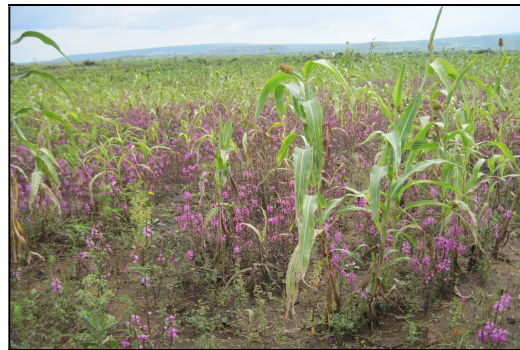
Figure 1: a sorghum field site in Ethiopia sampled in the PROMISE project to map the Striga seedbank and to characterize the soil and sorghum root microbiome.

suppression of Striga and other root parasitic weeds have focused on the activities of single microbial species, mostly fungi and bacteria. In the PROMISE project, the ultimate goal is to design synthetic microbial communities (SynComs) or identify microbial metabolites that consistently suppress Striga infections or trigger suicidal germination of the Striga seed bank. The design of SynComs should involve microbes with complementary modes of action that act together or synergistically, and preferably at different stages of the parasite's life cycle. This reinforces the need to understand the taxonomic and functional diversity of the sorghum root microbiome and the dynamic changes in the microbiome during plant and parasite development as well as their interaction. Moreover, a microbiome-mediated strategy for Striga control should take into account how each microbial member of the consortium behaves across different soil conditions, how their activities are influenced by the genotypic diversity of the host and parasite as well as by other commonly used agricultural practices used to control Striga (e.g. crop rotation, trap/catch crop).