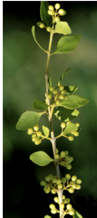
Tupeia antarctica