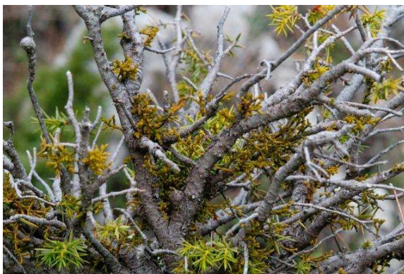
A. oxycedri on J. oxycedrus

No true seed is formed, as there is no testa, but the embryo is embedded in chlorophyllous endosperm, referred to as a seed for convenience, surrounded by viscin. The embryo is green, a few millimetres long, and has a meristematic radicular apex without a root cap. Dispersal of the seed is exceptional, involving a hydrostatic, explosive process which expels the seed at least 10 m (CABI, 2020). It is included in this Invasive Species Compendium due to its potential, if introduced, to damage North American species of economic value.