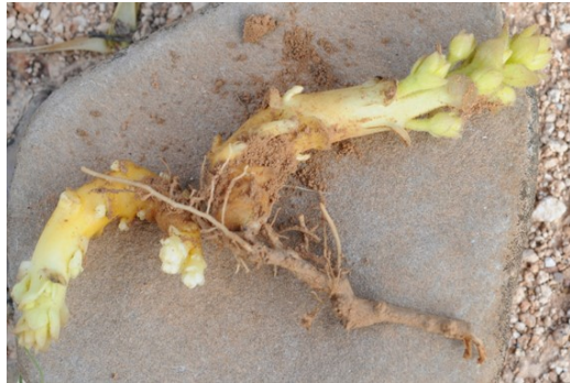
Alectra orobanchoides

potential host as we have learned from decades of field work, but excavation showed a connection between roots.