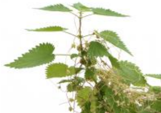
The holocentric European dodder ( Cuscuta europaea ) entwines a nettle.

Whenever the European dodder, Cuscuta europaea , is under scientific scrutiny, it usually is due to its lack of chloroplasts and its concomitant parasitic lifestyle. However, since the beginning of this year its chromosomes became the new centre of attention, when researchers discovered a new type of centromere inherent to C. europaea . Whilst the positioning of the centromeres on the chromosome is normally determined by the locations of CENH3 histones, the centromeres of C. europaea were positioned in some chromosomal regions also independently from the plant's occurrence of CENH3.